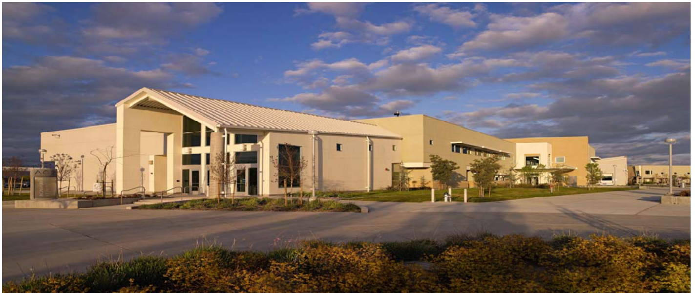
Photo: Willow International Phase 2

The District has prepared the following Measure E Project Status Report for the Bond Oversight Committee. The purpose of the report is to update the Committee on the projects approved by the State Center Community College District Board of Trustees for funding and authorization to proceed during each of the fiscal years 2003-04 through 2013-14. The expenditures reported are as of September 30, 2013.