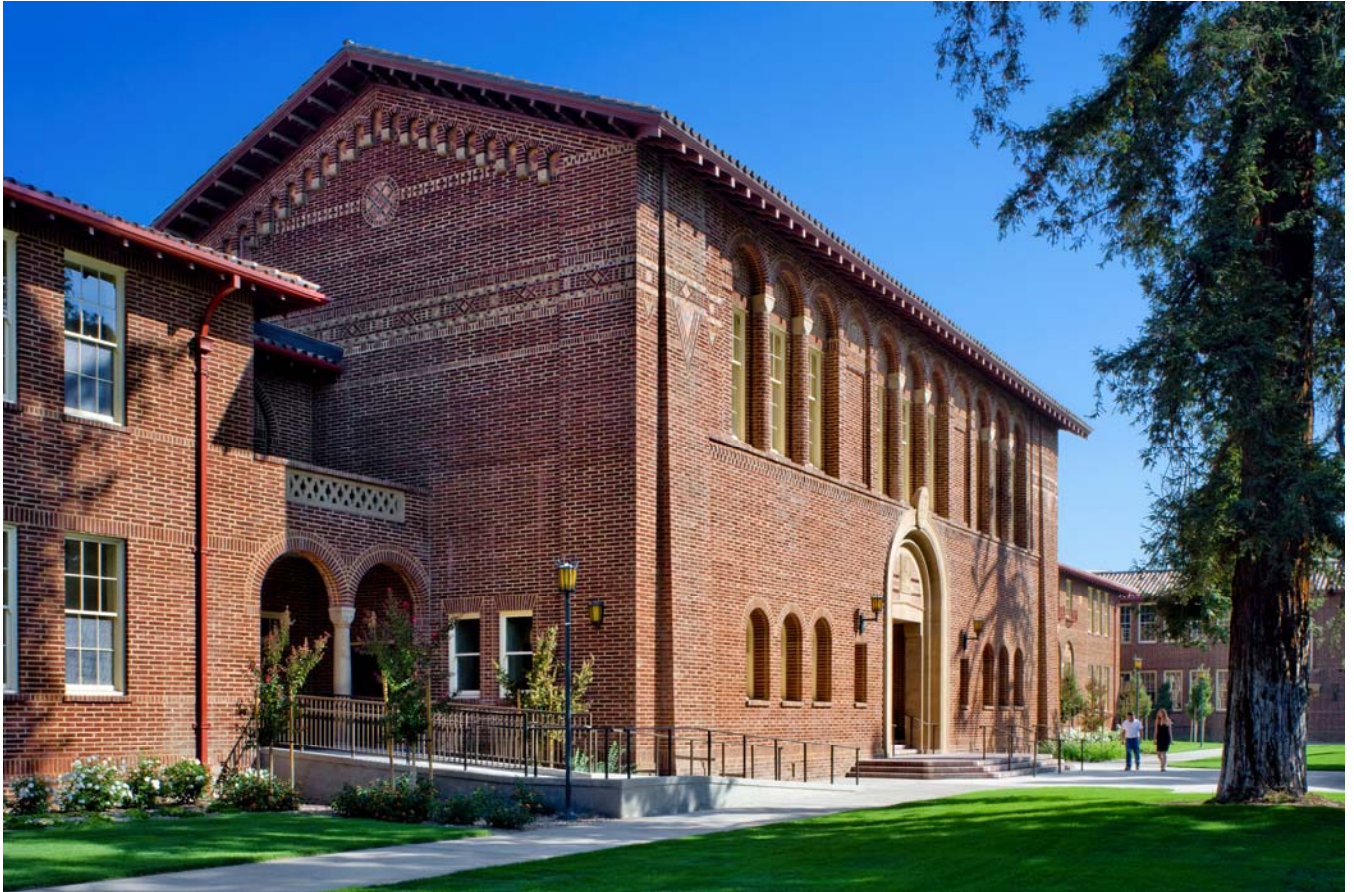
Photo: Fresno City College Old Administration Building