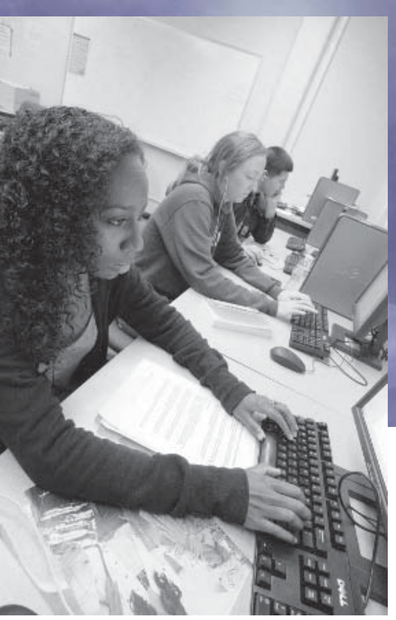
FCC Student Athletes take a time out to focus on

If you're interested in supporting The Zone, please contact SCCC Foundation at (559) 244-5991 or email gurdeep.hebert@scccd.edu.